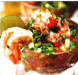
Coctel de Camaron