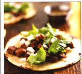
MEXICAN STYLE TACOS