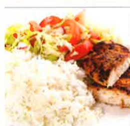
Pechuga de Pollo