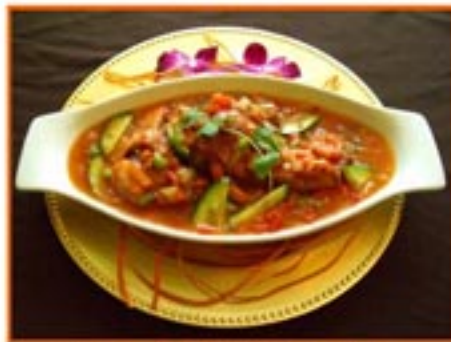
CS03. Three Flavour Fish (Pla Sam Rod)