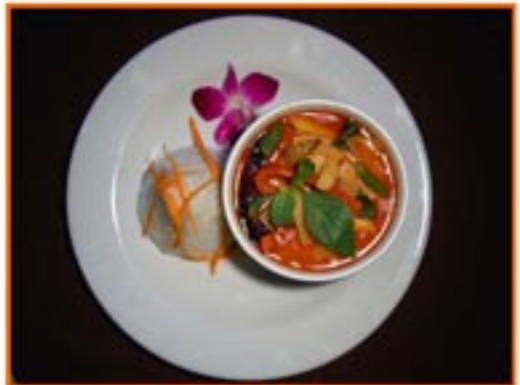
C02. Red Curry