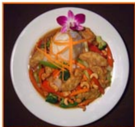
M01. Cashew Nuts (Gai Pad Med)