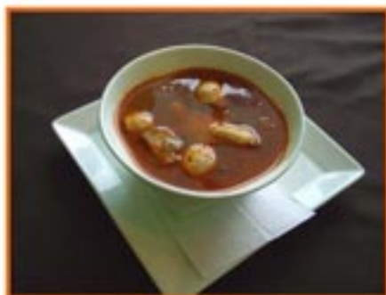
SO1. Tom Yum Soup