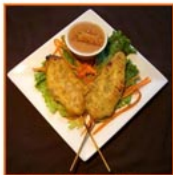
A01. Chicken Satays