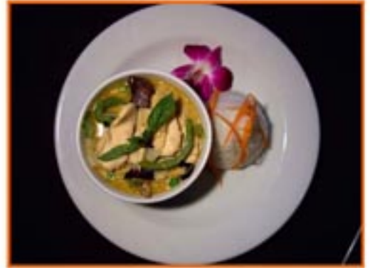
C01. Green Curry