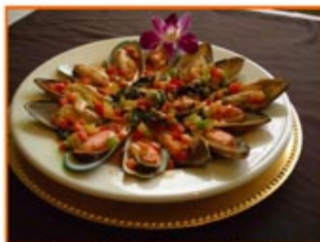
CS01. Thai Palace's Mussels

Stir-fried Thai Palace ginger garlic sauce with breaded chicken, bell peppers and onions.