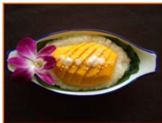
D01. Sticky Rice with Sweet Mango