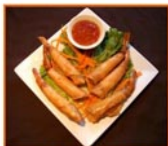
A06. Golden Tiger Shrimp

Golden brown and crispy tiger shrimp. Served with homemade sweet and sour sauce.