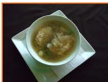
SO4. Thai Palace Wonton Soup

Tender morsels of chicken added to a broth of rich coconut, enhanced with galangal, lemongrass and Thai spices.