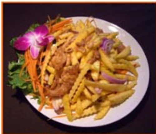
SA1. Mango Salad (Yum Mamuang)

Strawberries, pineapple, green apple, and cherry tomatoes, mixed with fresh chilies and cashew nuts in Thai Palace dressing.