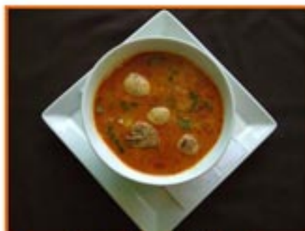
SO2. Tom Kha Soup

Thailand's most popular soup with mushrooms, tomatoes, kaffir lime leaves in a lemon grass broth. Flavoured with lemon juice and garnished with green onions.