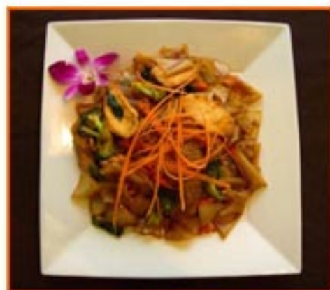
N02. Pad See-Ew