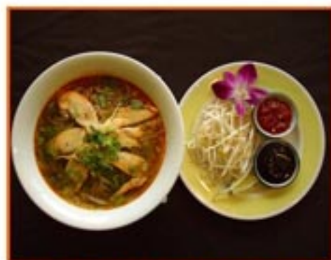
N06. Thai Rice Noodle Soup