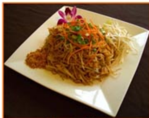
N01. Pad Thai

Stir-fried spaghetti noodles in Thai ginger garlic sauce and tamarind sauce with onions, celery, carrots, green beans, broccoli, mushroom and Thai sweet basil.