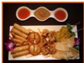
A10. Thai Palace Sample

Golden deep-fried ground white fish spiced with fresh kaffir lime leaves, eggs, finely sliced long green beans and red curry paste. Served with sweet and sour sauce.