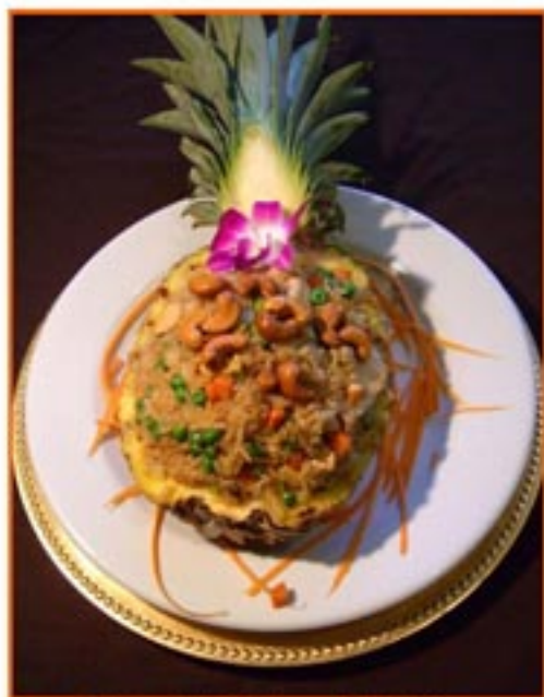
R01. Thai Palace Fried Rice (Khao Pad Sup Pa Rod)

R01 Thai Palace Fried Rice (Khao Pad Sup Pa Rod) Thai Jasmine rice fried with fresh sweet pineapple, onions, shredded carrots, snow peas, eggs, and topped with roasted cashew nuts. ( Served in half of a pineapple. )