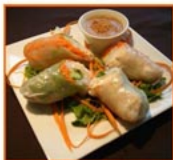
A02. Fresh Spring Rolls