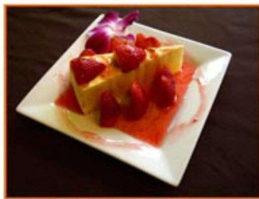
D03. New York Style Strawberry Cheesecake