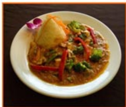
M03. Thai Palace's Peanut Sauce

Sweet bell peppers, green beans, mushrooms, and broccoli. Stir-fried with Thai Palace's Peanut Sauce.