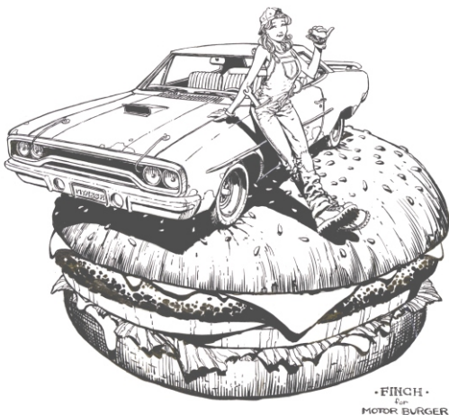
FINCH MOTOR BURGER

kobe classic brisket, grilled portobello, blue cheese, caramelized onion, white truffle oil single $18.00 - supercharged $27.00